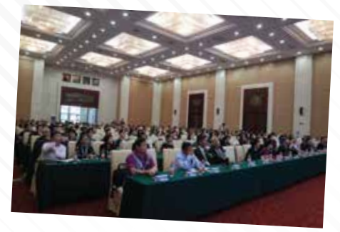
會議吸引超過250位愛滋病防治同仁參與 More than 250 front-line workers and HIV professionals participated in the Meeting