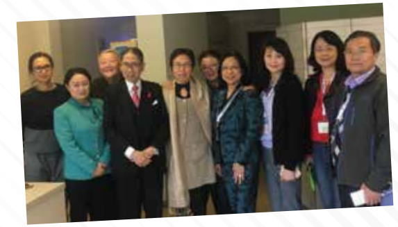
參觀江蘇當地社會組織—你我健康中心 Paid a visit to Jiangsu You and Me Health Center, a community-based organisation in Jiangsu